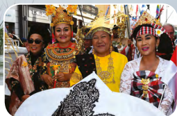
THE GREAT PARADE